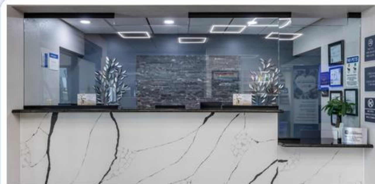
Professional Front Desk