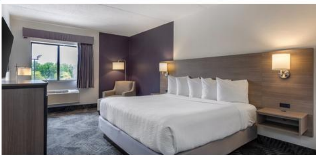
Renovated Guest Rooms